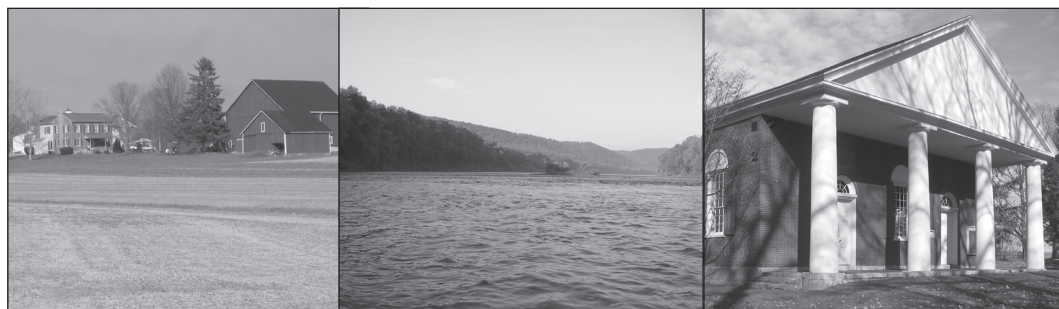
Scenic farms, the Susquehanna River, and the Warrior Run Church are among the region's important resources that could be linked by pathways.

itects and planners from SEDA-COG's Community Resource Center will assist in the development of a Pathways master plan, depicting all of the trail, recreation, and conservation opportunities of the region. Most importantly, the Task Force, municipal officials, and residents will evaluate the potential for an early-action demonstration project.