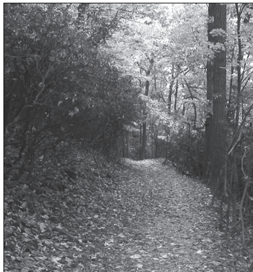
Pathways can provide both recreation and conservation benefits to a community.