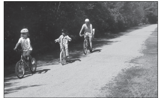
Trails and pathways provide community linkages as well as recreational, educational and social opportunities.

The Warrior Run Community Corporation (WRCC) was recently awarded a $20,000 grant by the Pennsylvania Department of Conservation & Natural Resources (DCNR) to initiate a new project addressing community recreation and conservation priorities. WRCC has undertaken this project based on the findings of a Warrior Run citizen survey that prioritized the protection of the area's rural character, heritage and quality of life into the future. The Pathways project will actively engage residents of the Warrior Run school district in developing a plan for an interconnected system of trails and natural areas that will promote conservation and responsible growth in the region. The goal is to provide residents with additional recreational and educational opportunities by connecting towns and villages to parks, school facilities, historic landmarks and natural areas.