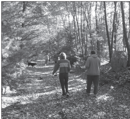
Residents of Warrior Run have identified walking as a number one priority.

A pathways network will further distinguish the Warrior Run community and enhance the high quality of life enjoyed by area residents for years to come.